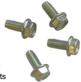
VT7500 Set 4 Bolts 5/16 & 3/4 Hex